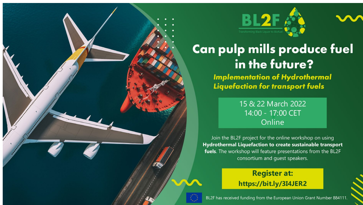
Figure 1: Save-the-Date visual

Save-the-Date visual: a graphic was designed to pique interest in the workshop and was disseminated widely on the BL2F social media, with the first post sent out in December 2021.